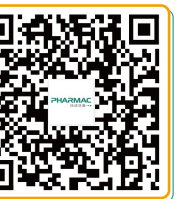
产品视频 Product Video

让生活更灵活, 更简单 Life Science manufacture Delivered with flexibility, simplicity & safe!